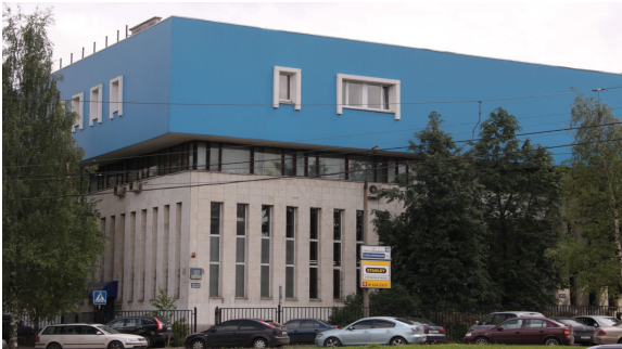
Moscow 119526, 101 (1) prospect Vernadskogo

Conference venue is Ishlinskiy Institute for Problems in Mechanics of the RAS (IPMech RAS)