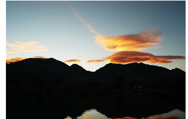
The family of the clouds in the lee (attached) internal waves (Foothills of the Rocky Mountains, Boulder, USA, November 12, 2012)

Papers on close topics can be included in the school. Number of papers presented by one author is not limited.