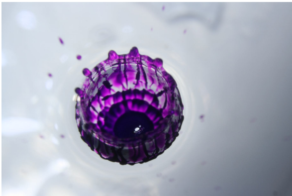
Spreading of droplets of solution of potassium permanganate in water